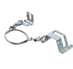
WV-Q105A Mount Bracket