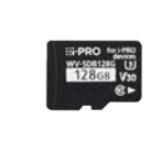
WV-SDB128G i-PRO SD Memory Card