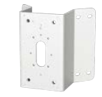
WV-QCN500-W Mount Bracket