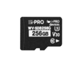
WV-SDB256G i-PRO SD Memory Card