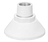
WV-QSR506F-W Mount Bracket