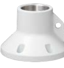
WV-QCL100-W Mount Bracket