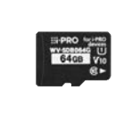
WV-SDB064G i-PRO SD Memory Card