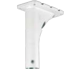
WV-QCL501-W Mount Bracket