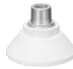
WV-QSR506M-W Mount Bracket