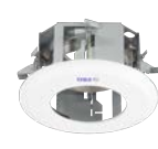
WV-QEM505-W Ceiling Mount Bracket