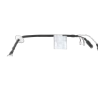
WV-QCA501A I/O Cable