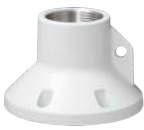
WV-QCL101-W Mount Bracket