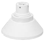
WV-QSR506-W Mount Bracket