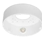
WV-QJB505-W Base Bracket