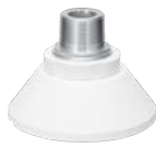
WV-QSR506M1-W Mount Bracket