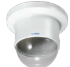
WV-QCD100C-W Dome Cover