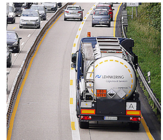
AG Neovo SX-Series