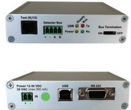
IFM-485-ST – RS-485 Interface Module

Download the latest firmware from the Xtralis partner portal www.xtralissecurity.com (doc. no. 29461). The download file contains the actual firmware and the installation file of the ADPRO Flashloader software.