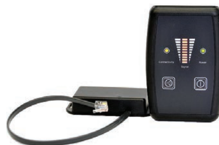
CT PRO 2 (Wireless Walk Tester)