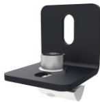
VWA-01/ VWA-02/ VWA-03